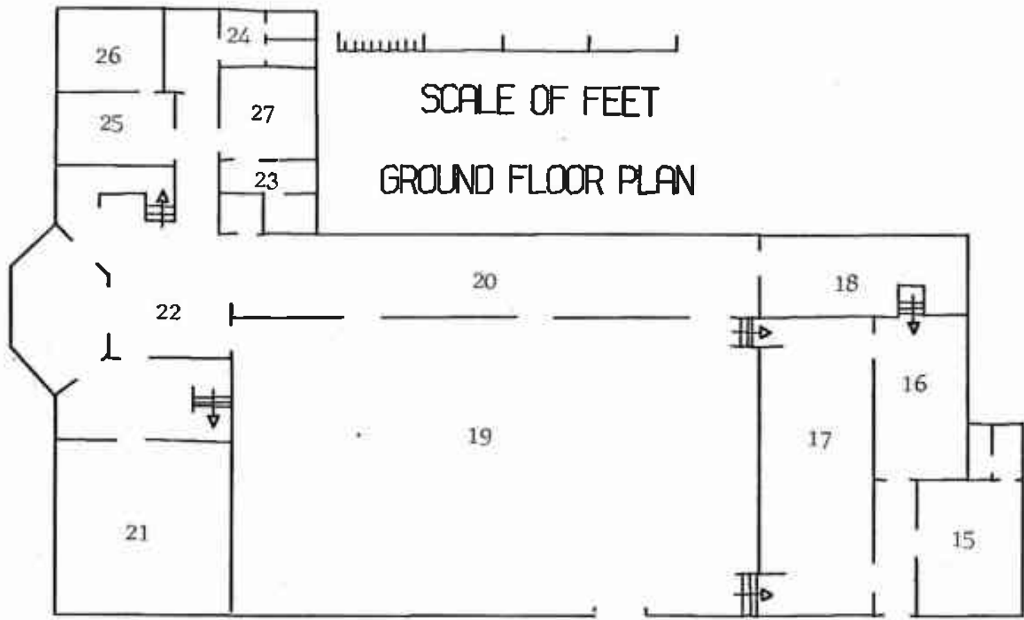
SCALE OF FEET GROUND FLOOR PLAN